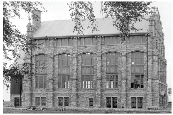
When we began - 1922

After two years of construction, it's time to celebrate the beautifully refurbished exterior of our 92-yearold building. Our new alabaster stone work will be glistening as we dedicate the church for the years ahead. Join us on Sunday morning, Oct. 5.