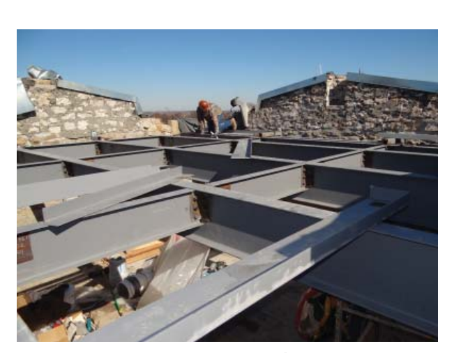
2012 Tower Repair