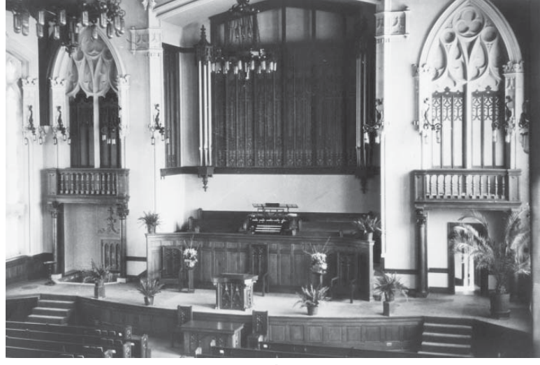
Sanctuary in 1927