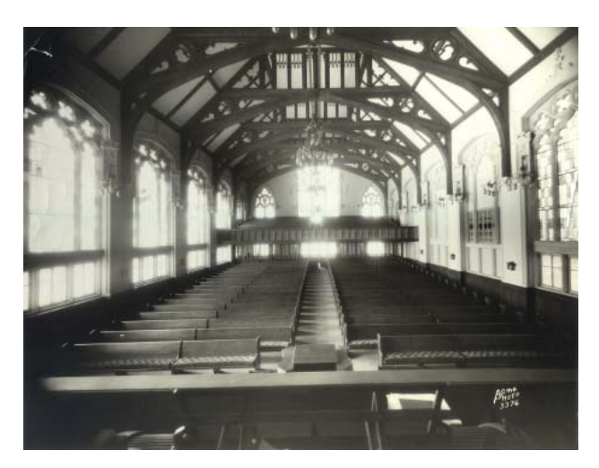
Sanctuary in 1942