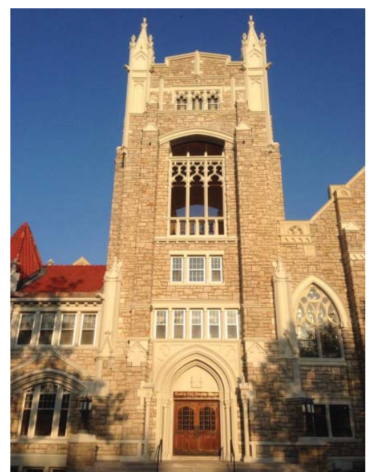
Today with renovation complete

We will have regular services at 9:00 a.m. in the Sanctuary and at 10:00 a.m. in Combs Chapel.