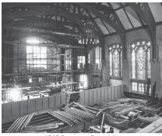
1949 Sanctuary Remodel