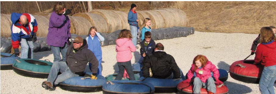
Club Kids spent an afternoon on Feb. 22 snow tubing in Weston, MO.