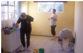
Team members working at Them bani Centre.

The team traveled to the rural township of Bedford for a majority of their work, helping at the Them bani Special Day Care Centre. They hung curtains made by our congregation's sewing ladies, painted and built shelves. They organized