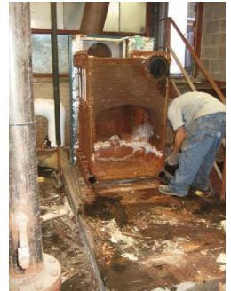
Work crew removing old boilers.

The decision to buy new boilers was made after a failure within the old one was judged too expensive to repair. The two new boilers provide a primary/secondary system that is much more efficient than the old one. One of the boilers is twice the size of its companion and will be the primary heating source. The smaller boiler will provide redundancy and extra power if needed.