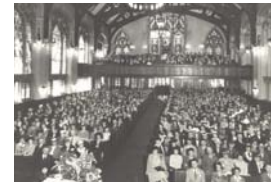
Sanctuary, Easter 1943

Please take a moment to enjoy the first project of the committee. The church hallways in the administrative area of the building are lined with photographs and artifacts