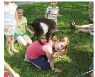
Children played in the petting zoo at the 2008 Spring Fling.