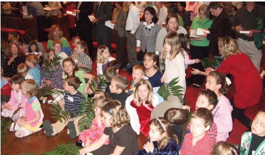
Below: Children gathered at the front of the sanctuary during the 11:00 a.m. service.