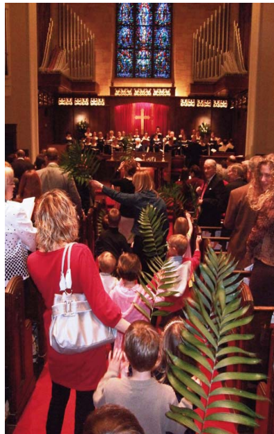
At right: Parents and children waved palms as they entered the sanctuary.