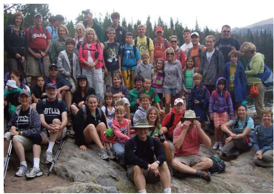
A group from Country Club Christian Church enjoyed fellowship and community among the sights of Colorado during Christian Community Camp July 31-Aug. 6. Watch for information to sign up for the 2012 camp on July 28-Aug. 4.