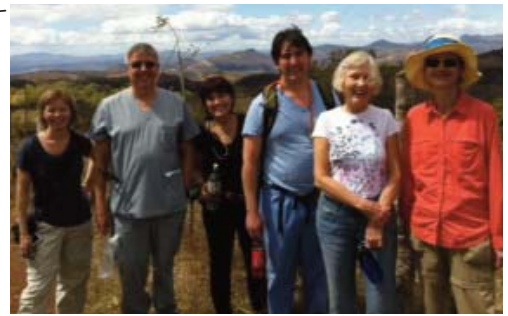
2011 Mission Team