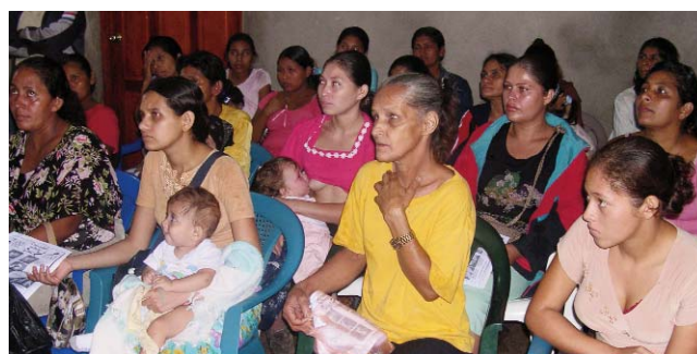
Families in Nicaragua wait to see the medical team.

Nicaragua Mission Trip Report – See the photos and hear the stories from the summer 2008 Nicaragua mission trip. Join us Sun., Dec. 7 from 9:55 to 10:55 a.m. in the Social Hall.