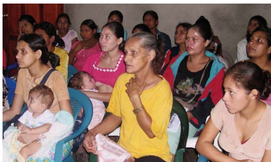
Families in Nicaragua wait to see the medical team during the summer 2008 trip.

See the photos and hear the stories from the summer 2008 Nicaragua mission trip. Join us Sun., Dec. 7 from 9:55 to 10:55 a.m. in the Social Hall.