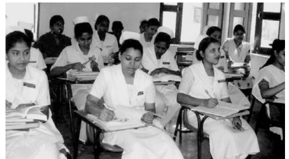
Students at the Tilda Nursing School in India.

Global Ministries' partner, the Tilda Nursing School at the Tilda Evangelical Mission Hospital