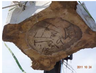
underside of tower spire